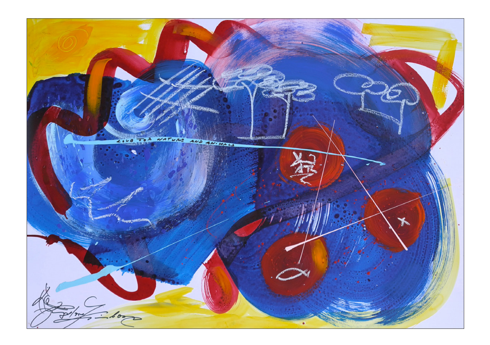
Untitled #3, 2012, acrylic on cardboard, 24.8 x 16.9 in