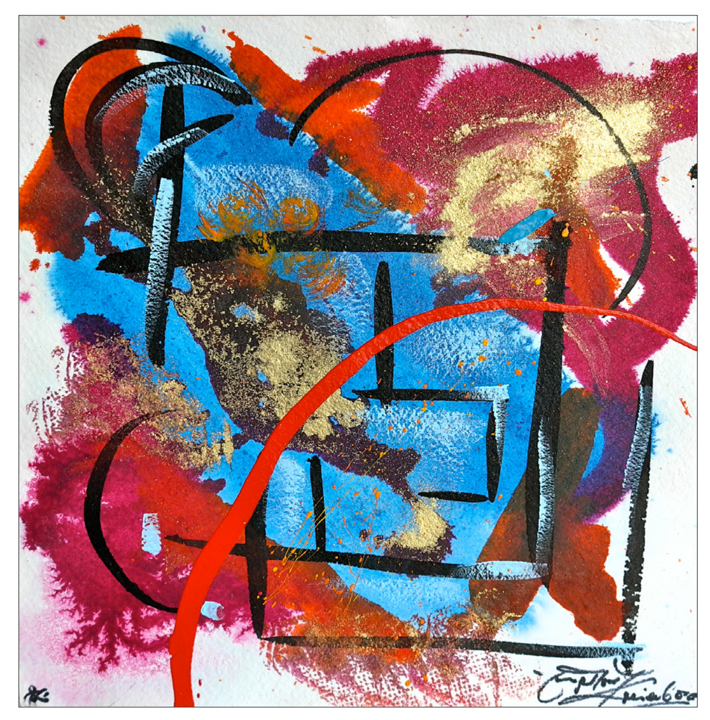
Blue House, 2012, acrylic on paper, 11.8 x 11.8 in