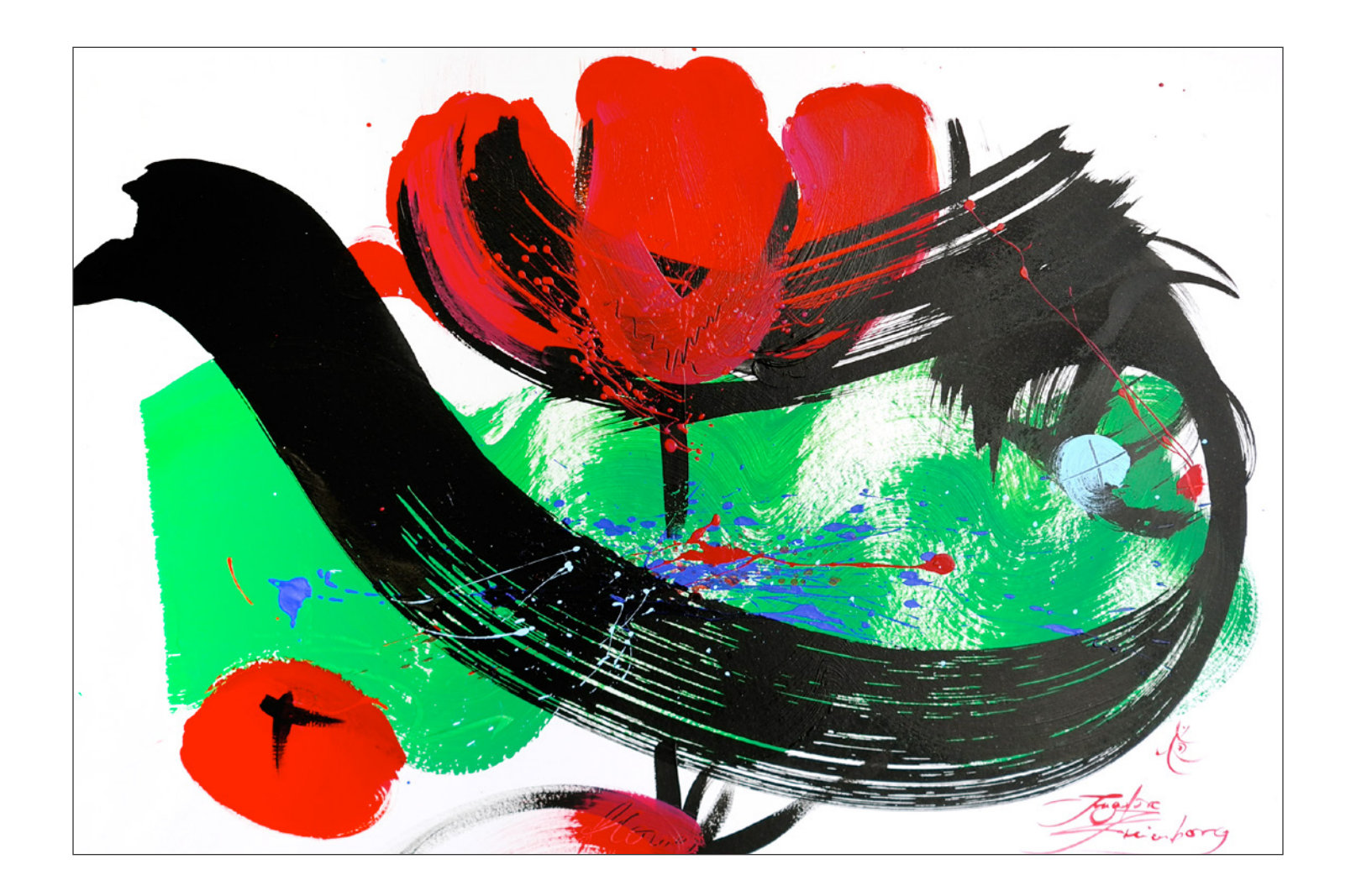
On My Way, 2012, acrylic on paper, 27.5 x 19.6 in