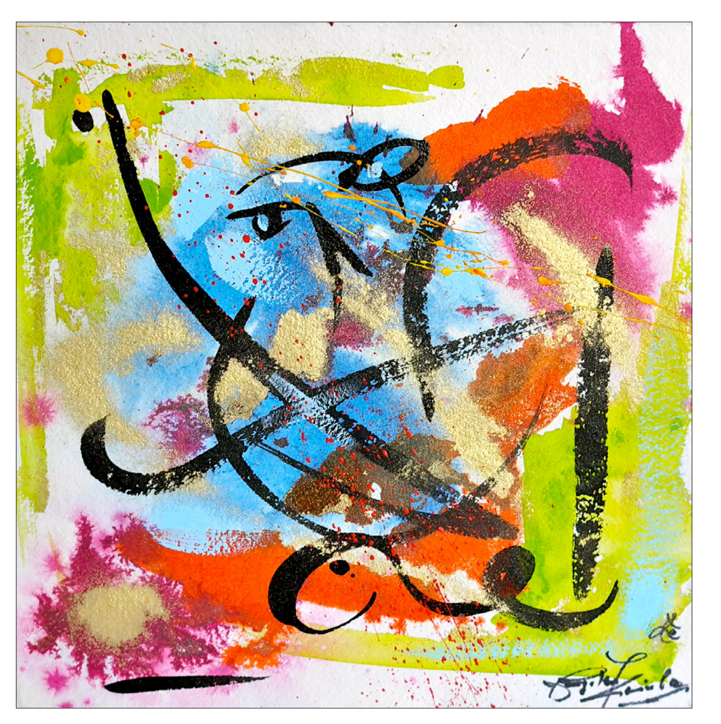
Blue Sky, 2012, acrylic on paper, 11.8 x 11.8 in